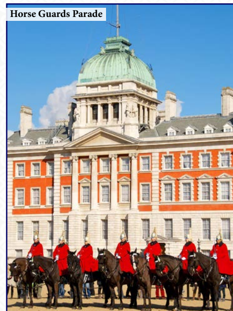
Horse Guards Parade