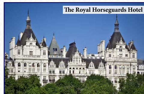
The Royal Horseguards Hotel