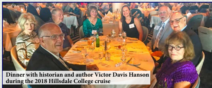
Dinner with historian and author Victor Davis Hanson during the 2018 Hillsdale College cruise

Following disembarkation, extend your trip by joining an exclusive Winston Churchill-themed post-cruise tour in and around London.