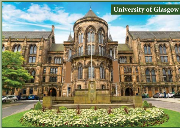
University of Glasgow